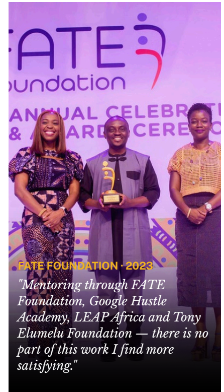
FATE FOUNDATION · 2023