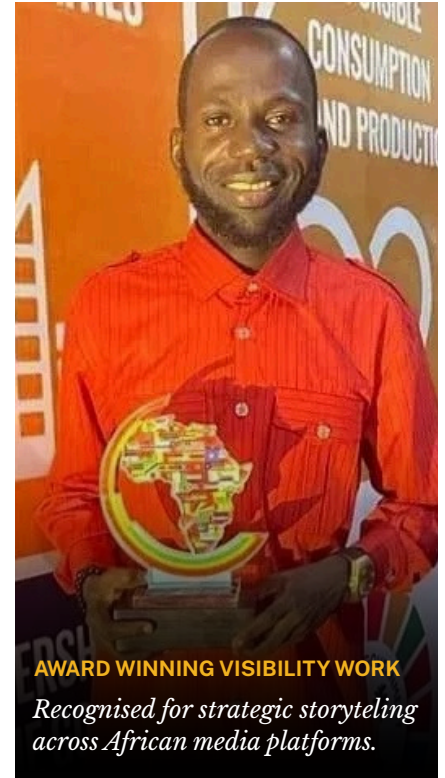
AWARD WINNING VISIBILITY WORK